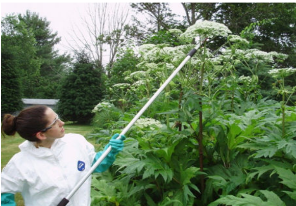
Adult giant hogweed plants are very tall, have white, umbrella-shaped flower clusters, and stems with purple splotches.

Giant hogweed plants are beginning to bloom across many parts of the state, making it a prime time to spot this harmful invasive species. Giant hogweed is a large, flowering plant from Eurasia with sap that can cause painful burns and scarring. Adult giant hogweed plants tend to be 7-14 feet tall with an umbrella-shaped cluster of white flowers up to 2.5 feet wide. The stem is green with purple splotches and coarse white hairs, and leaves are large (up to 5 feet across), incised, and deeply lobed. The most common lookalike found in NY is our native cow parsnip, which flowers earlier and does not have the purple splotches on the stem (but can also cause burns). You can find more identification tips, including a table of other lookalikes, on our website. If you think you have found giant hogweed: Do not touch it. From a safe distance, take photos of the plant's stem, leaves, flower, seeds, and the whole plant. Report your sighting to DEC by emailing photos and location information to ghogweed@dec.ny.gov or by calling (845) 256-3111. DEC staff will help you identify whether the plant is giant hogweed and provide you with information about giant hogweed control methods and DEC's control program. If the plant is confirmed to be giant hogweed, DEC will seek permission from the landowner for a field crew to visit and perform giant hogweed control at no cost.