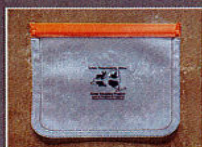
Reusable sandwich bag