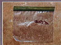
Plastic sandwich bag