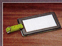
Reusable plastic tag holder