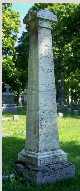
The Potter family plot monument.