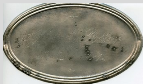
L to R, An example of a business card for a coffin plate chaser, the coffin plate from Sylvia Potter who died in 1859.