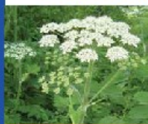
Cow Parsnip May cause burns.