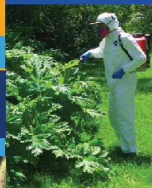
Spraying with herbicide

DEC is working hard to control giant hogweed.