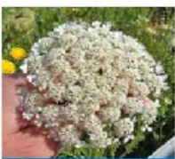
Queen Anne's Lace