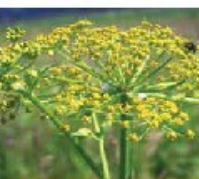
Wild Parsnip DON'T TOUCH! CAN CAUSE SEVERE BURNS.

ghogweed@dec.ny.gov Giant Hogweed Hotline: 1-845-256-3111