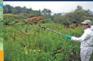
Removing seed heads

Giant hogweed is an invasive, non-native plant classified as a noxious weed. It is unlawful to propagate, sell or transport. In addition to being a health concern, it crowds out other plants and causes soil erosion.