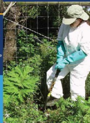
Cutting the plant root