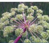
Angelica May cause burns.