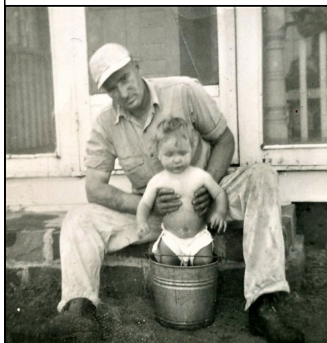
BLAST FROM THE PAST!